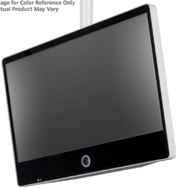
Image for Color Reference Only Actual Product May Vary