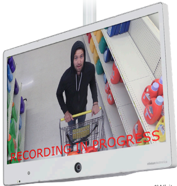
*White Front / White Cabinet