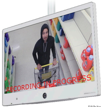
*White Front / White Cabinet