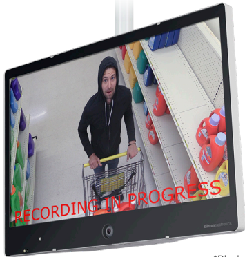
*Black Front / White Cabinet