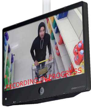
*Black Front / Black Cabinet

21" Public View Monitor w/ AXIS IP Camera