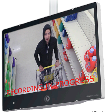
*Black Front / White Cabinet

27" IP Public View Monitor w/ AXIS IP Camera