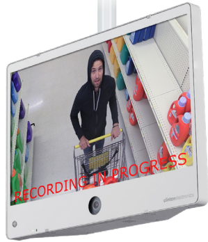
*White Front / White Cabinet

21" Public View Monitor w/ AXIS IP Camera