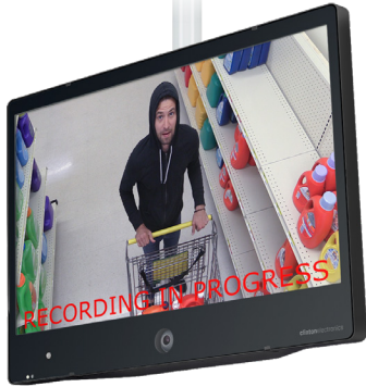
*Black Front / Black Cabinet

27" Public View Monitor w/ AXIS IP Camera