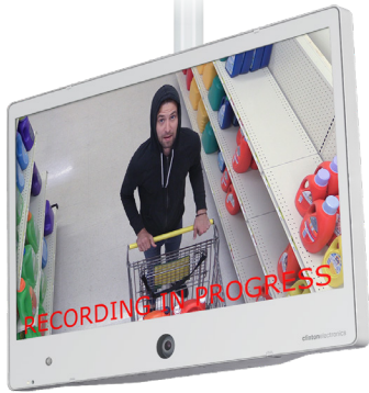
*White Front / White Cabinet

27" Public View Monitor w/ AXIS IP Camera