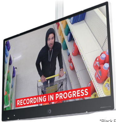
*Black Front / White Cabinet