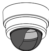
Cutout Mask Non-IR Cameras